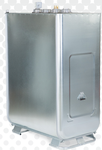
2 IN 1